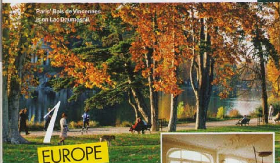
Paris' Bois de Vincennes is on Lac Daumesnil.

No country is more synonymous with the word "green" than Ireland.