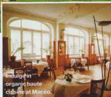
Indulge in organic haute cuisine at Macéo.

On rue Saint-Germain, stop in for an organic Pinot Noir at Phyto Bar , then drop by Alter Mundi, which offers chic and colourful Bluebretzel T-shirts spun from organic Malian cotton. And don't forget to hit the couture houses—after all, the exquisite creations at Balenciaga and Chanel are made by hand right in the city. For dinner, head to Macéo . Health-conscious food lovers have been raving about its Menu au Verte, which offers tasty vegetarian fare. Or, opt for the delicious Dublin Bay Prawns and Tartare of Crab and—for the ambitious—a dessert of Breton Shortbread with Decadent Chocolate Ganache.